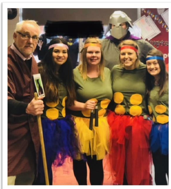
The Super Heroes in Years 5 & 6